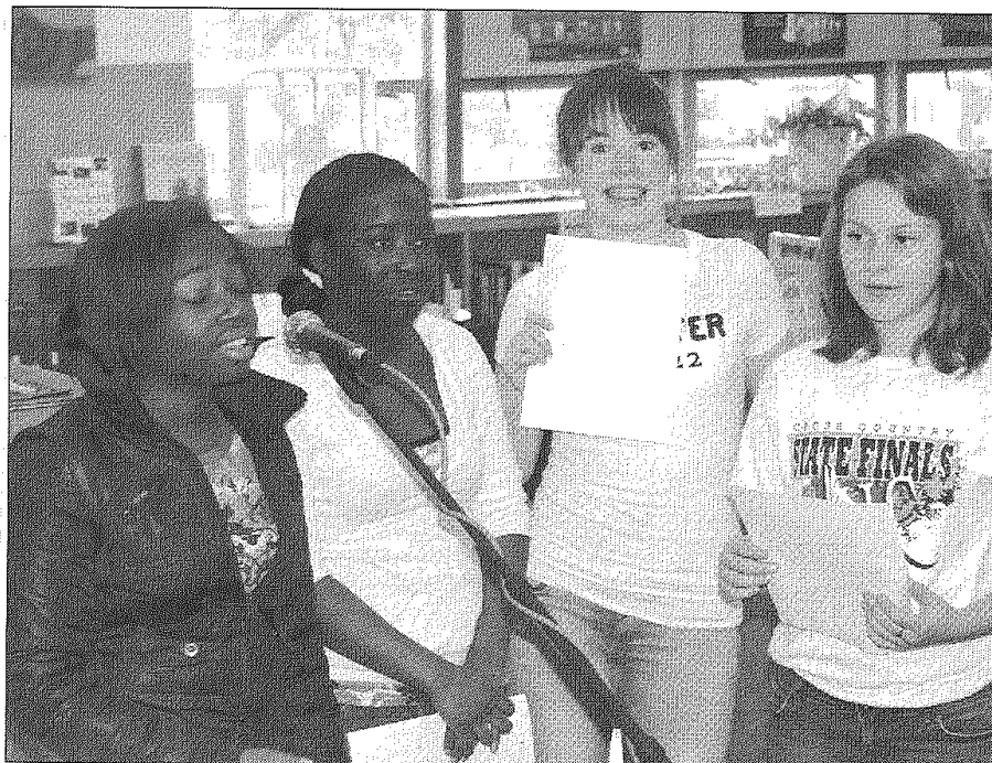
Eighth-graders at Franklin Middle School in Champaign sing 'Zebra Mussels' to the tune of 'Single Ladies.'