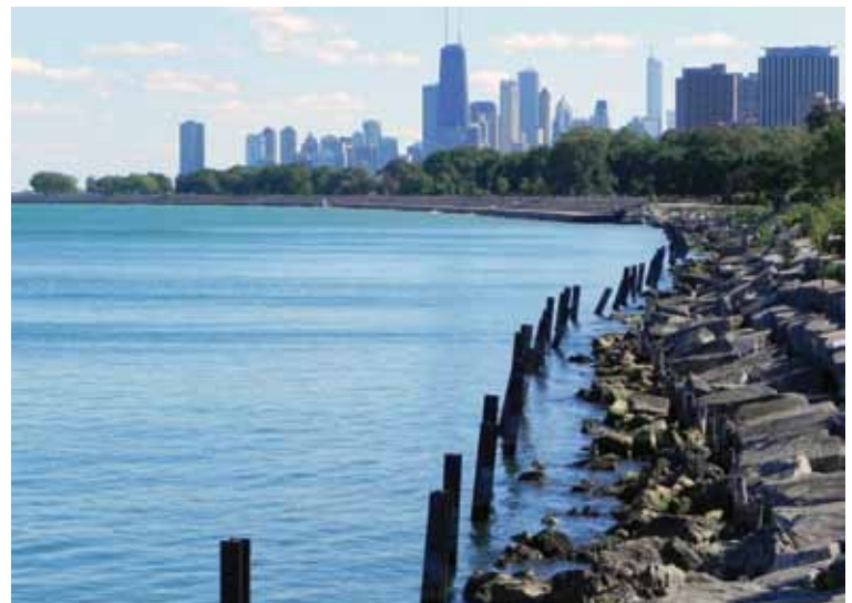
Lake Zurich is one of 10 communities that was recently approved to tap into Lake Michigan water.

One option being explored is tapping water from the Great Lakes, and Lake Zurich is one