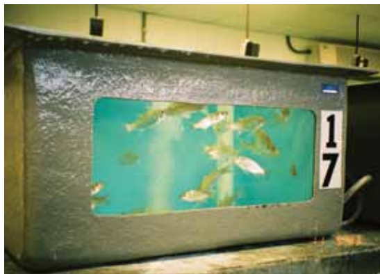
Fish swim in a Southern Illinois University Carbondale lab where researchers studied the use of ethanol yeast as a fish meal replacement for hybrid striped bass.