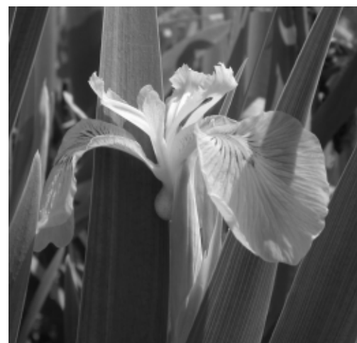
Iris pseudacorus